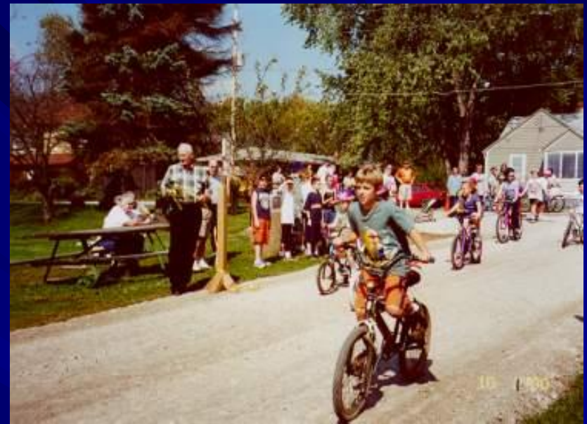
Towpath Trail, 101-miles