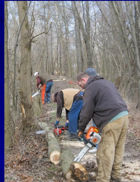
Tuscarawas County Towpath Trail March 2012