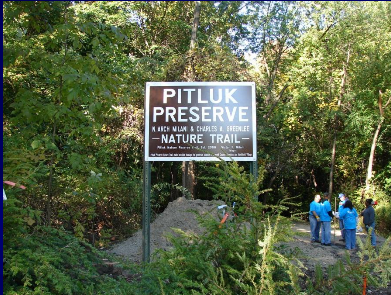
Summit County Trail & Greenway Plan