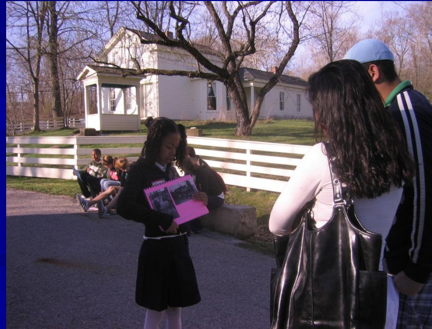
Towpath Trail, Akron, Ohio