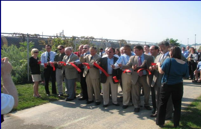
Steelyard Commons Trail Dedication