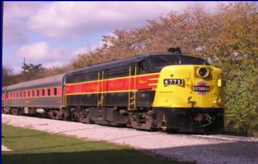
Cuyahoga Valley Scenic Railroad, 55-miles