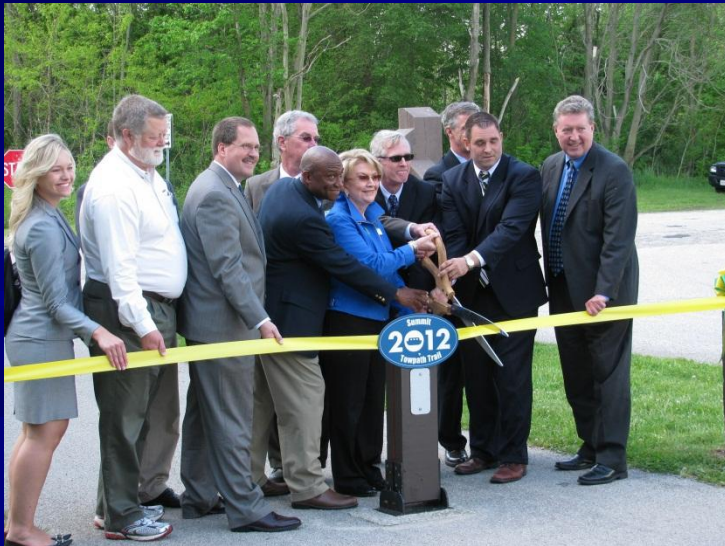
Barberton Towpath Trail Dedication, May 2012