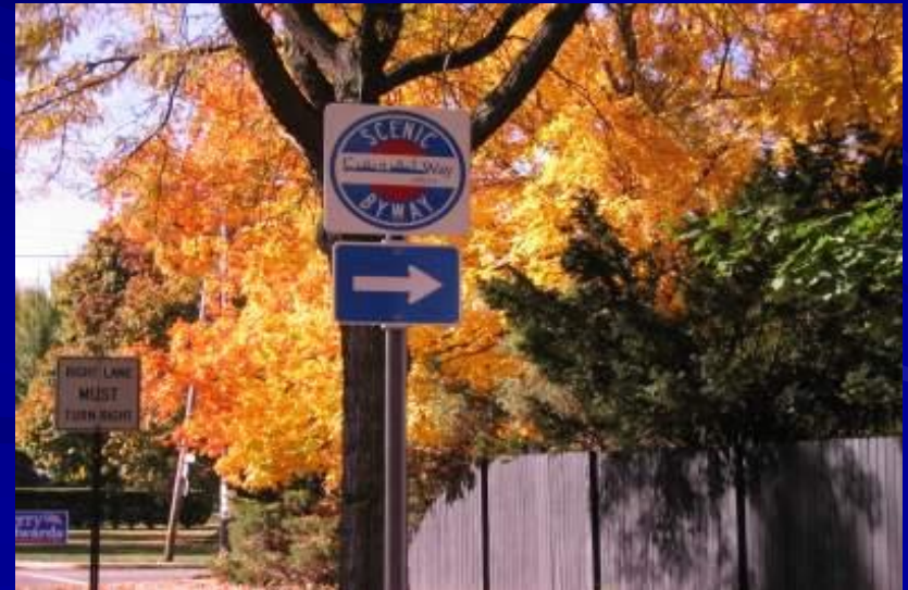
America's Byway, 110-miles